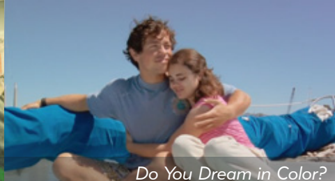
Do You Dream in Color?