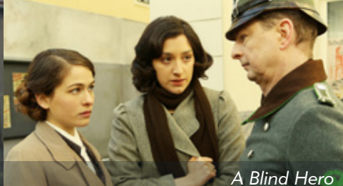
A Blind Hero