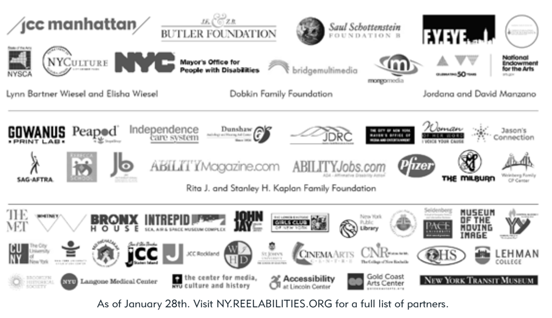
As of January 28th. Visit NY.REELABILITIES.ORG for a full list of partners.