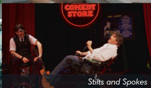
Stilts and Spokes