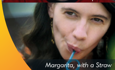
Margarita, with a Straw