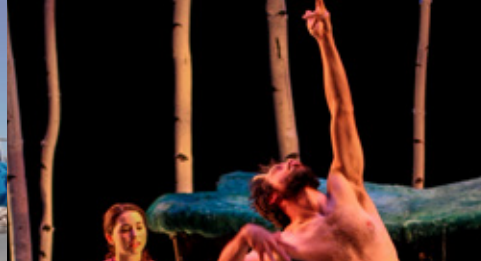
Enter the Faun