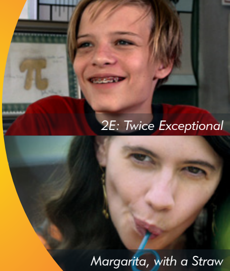
2E: Twice Exceptional