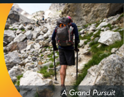
A Grand Pursuit

Olga, along with others from Mexico and Guatemala, is brought to New York under the false promise of being offered a scholarship at a sign language school. Upon arrival, they discover they are being held hostage by a cartel, and are forced to sell paper towels on the New York City subway.