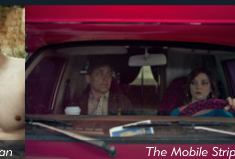
The Mobile Stripper